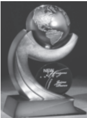
2 Grand Champion Trophies

1—Cheese & Butter Grand Champion 1—Grade A & Ice Cream Grand Champion