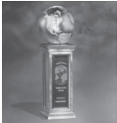
74—1st Place Trophies

1—Cheese & Butter Grand Champion 1—Grade A & Ice Cream Grand Champion